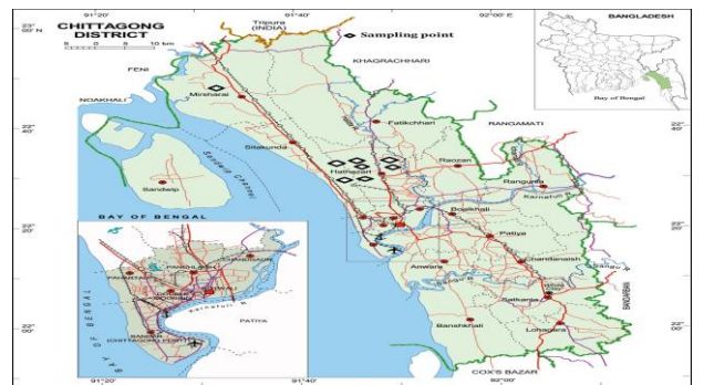
Figure 2 Map showing sample collection points of Hathazari (Non-industrial area).