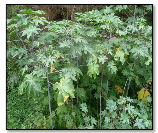
Figure: 9- Mirch