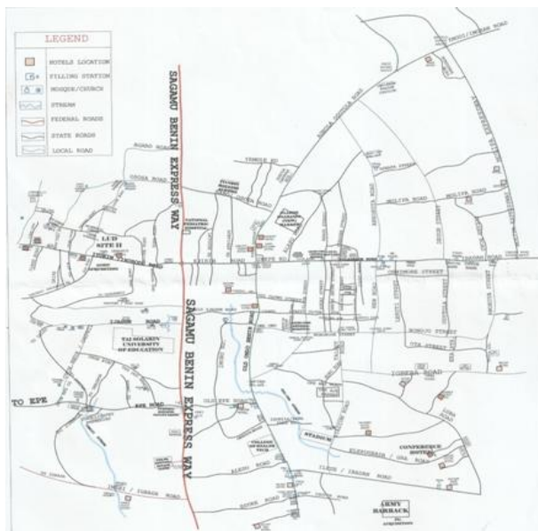
Fig 1: Ijebu-Ode L.G.A Road Map Showing Odo-Owa and Yemoji Streams