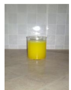
fig(2) Hibiscus vitifolius L.

We carried out this extraction method in order to avoid the filtration of the solvent and residue and also to obtain better efficiency of separation in this method[9]. 200 gram of fresh flowers was kept in the thimble of soxhlet extractor and 500 ml of solvent (ethanol80:water20) pourd in the RB flask and a condenser with high flow rate of water is fitted over it. The soxhlet apparatus was heated 70°c for 60 minutes. After extraction, the extract was filtered and used for dyeing. It was observed that, colour of the dye extract was milky yellow colour as shown in figure 2.