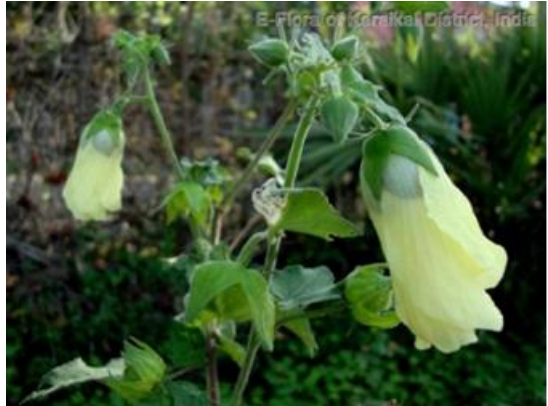
Fig: 1 Hibicus vittifolius.L,

2.1.2. Fabric: Desized, scoured and bleached cotton fabric was used for dyeing.