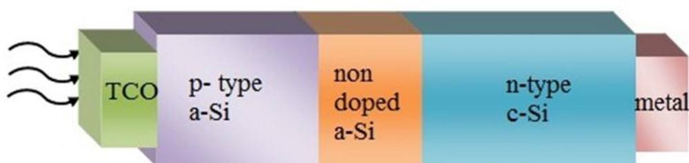
Fig. 2 Hetero junction with intrinsic thin layer Solar cell

By using ACJ (artificially constructed junction), they developed 2 a new structure of solar cell in where the a-Si thin i-layer is incorporated into the p/n hetero junction and named it Hetero junction with Intrinsic Thin Layer. The backward current was reduced and seems to reduce the recombination of carrier near the interface. They showed that the value of short circuit current ( I_{SC} ) was higher than that of the basic hetero-junction p/n (a-Si/C-Si) structure. Due to improvement in the interface properties the collection efficiency as well as short circuit current density ( J_{SC} ) was increased. In that case V_{OC} was increased by 30 mV and FF was also enhanced by more about 0.8 than p/n hetero junction structure. Conversion efficiency was also increased in HIT structure rather than p/n hetero junction structure. They had been able to fabricate high conversion efficiency stable HIT solar cell ( \eta = 18.1\% ) and prepared by simple low temperature process ( < 200^\circ C ). The output characteristics of HIT solar cell were unchanged after 10 hours irradiation. Therefore the hetero junction with intrinsic thin layer (HIT) technology sets a new