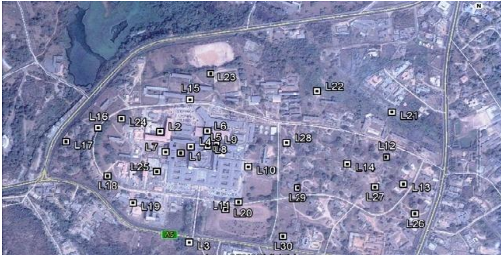
Figure 1: Map of the University College Hospital (UCH), Ibadan showing measurement locations

Spectral measurements were taken for GSM 900 and GSM 1800 bands. ‘Start’ and ‘Stop’ frequencies on the spectrum analyzer were set for each RF band measurement in accordance with the Nigerian Communications Commission’s Downlink Frequency Spectrum allocation. For GSM 900, the spectrum analyzer was allowed to sweep between start frequency of 935MHz and stop frequency 960MHz. For GSM 1800, the spectrum analyzer swept between the start frequency 1805MHz and stop frequency 1880MHz. A sweep sample time of 50mS was chosen on the spectrum analyzer so as to get a better spectral resolution of the displayed signal. However, there is a trade-off between how quickly the display can update the full frequency span under consideration and the frequency resolution.