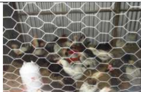
Figure 5: Deep litter system holding chicken in one of the farms in Kamkunji sub-county