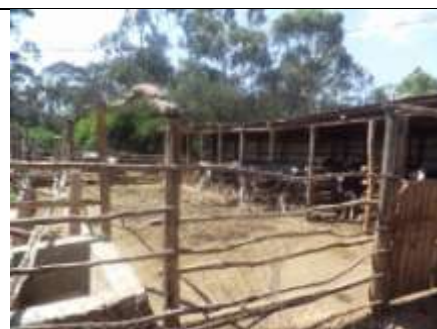
Figure 2: Temporary cattle house holding a herd of cattle in one of the farms in Kasarani sub-count