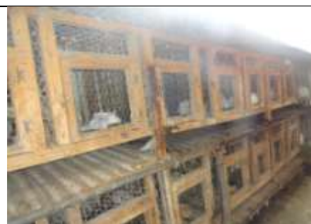
Figure 3: Rabbit hutch holding rabbits in one of the farms in Lang'ata sub-county