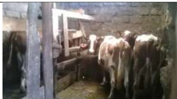
Figure 4: Permanent cattle house holding cattle in one of the farms in Embakasi sub-county