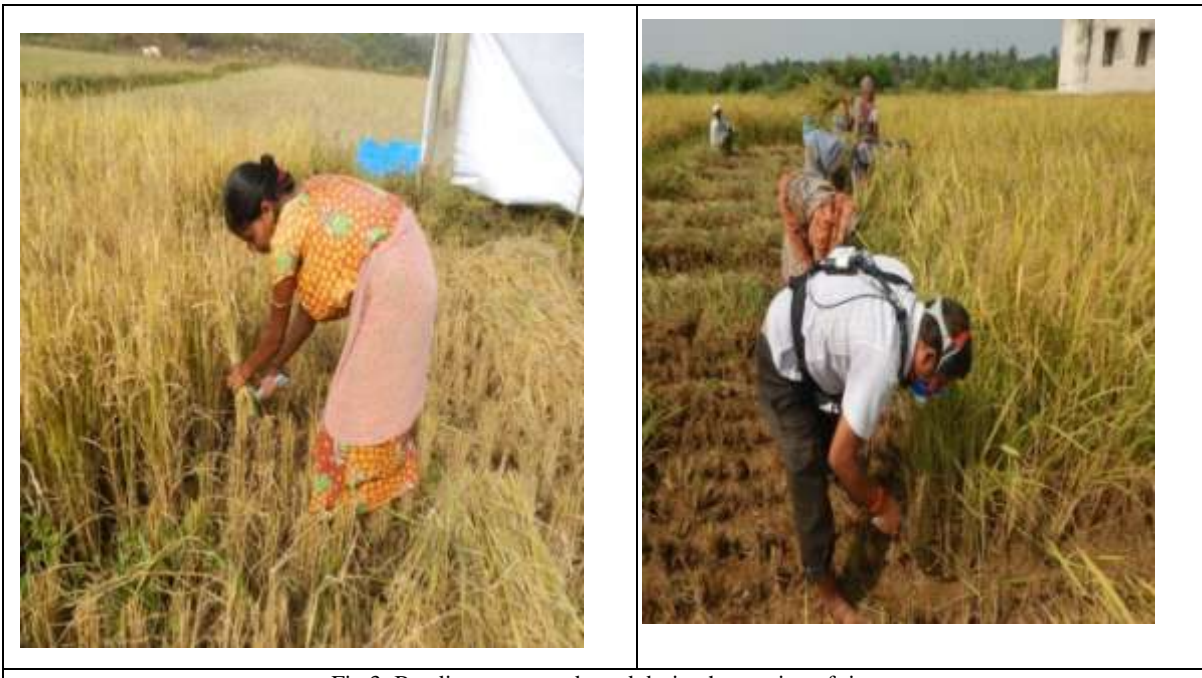
Fig 3: Bending posture adopted during harvesting of rice