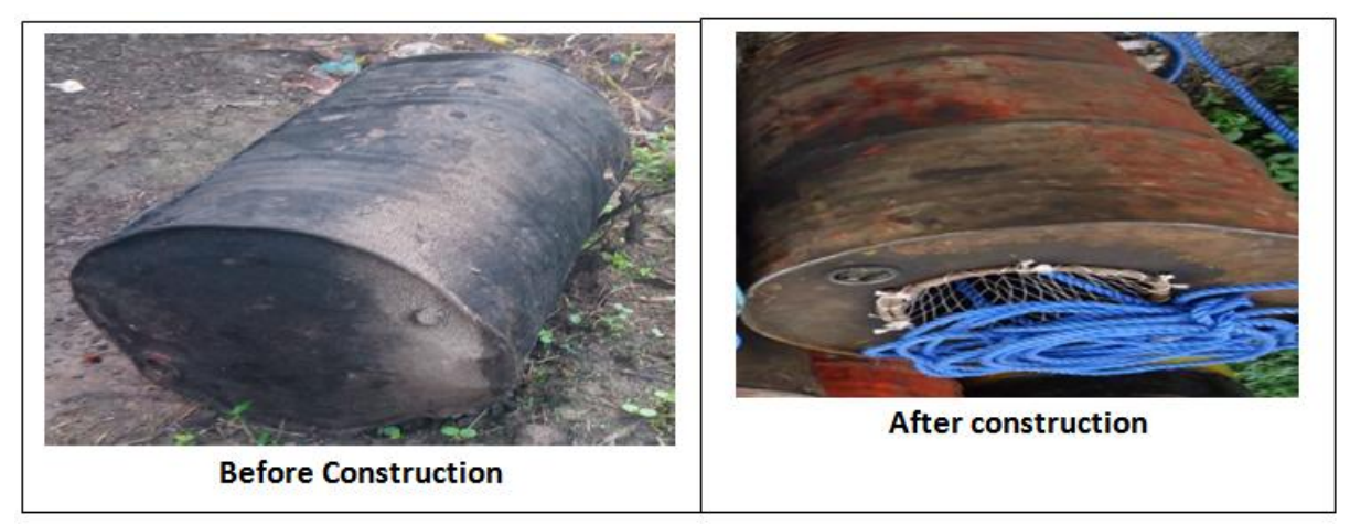
Plate 2: Drum trap before and after construction

Drum trap is relatively a new type of trap used at the Nun River around Polaku Town in Gbarain Kingdom in Yenagoa Local Government Area and its environs. The trap was and constructed with normal metal drum with dimensions (Plate 2): height 895mm, diameter 585mm, an opening for fish collection of 200mm and entrance (non-return) valve of 220mm.