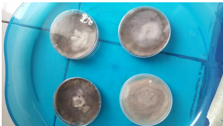
Plate 3: Picture Showing Pure Culture of Rhizopus stolonifer and Phoma glomerata