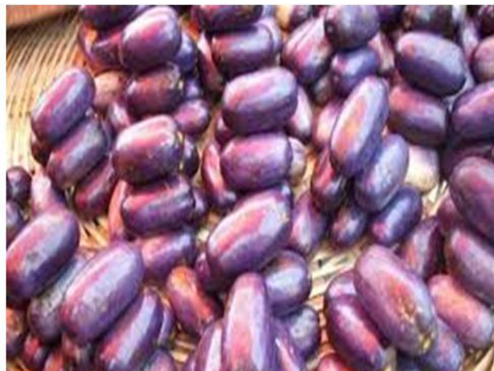
Plate 1: Photograph of African Pear

The bark of Enantia chlorantha plant was collected from Cross Rivers State National Park Akamkpa. The sample was subjected to surface stabilization using 5% alcohol and then air dried and further grounded into powder using blender (Monlinex 530, 240) and parked in polythene bags for further analysis (Chukunda et al. , 2019).