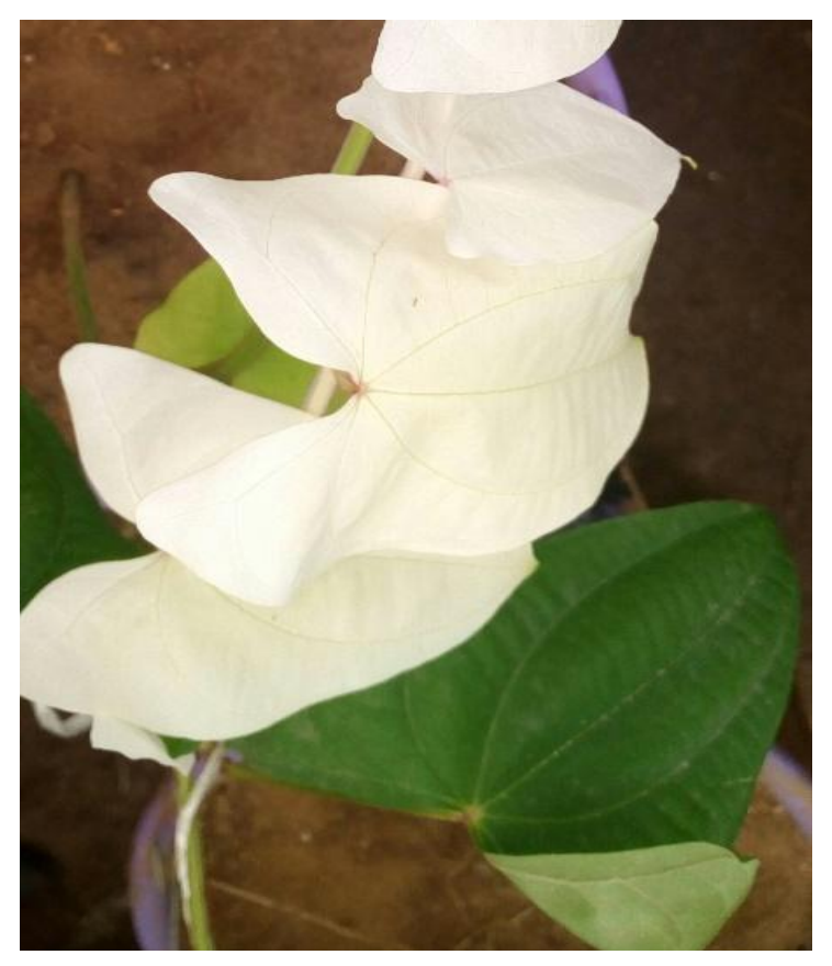
Fig. 1.Bleached leaves of D.alata plants in response to foliar Fluridone

Plants treated with Fluridone expressed observable color change by the sixth day of treatment application (Fig. 1). Some of the leaves showed extensive/complete bleaching with a white stem/vine while others were either partly bleached or green. In contrast, all leaves of plants growing in the Complete control expressed no bleaching.