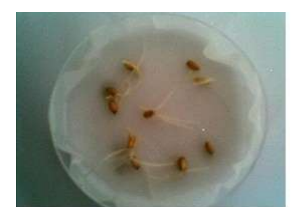
Fig.4 Petri plates with antifungal agent, after three days