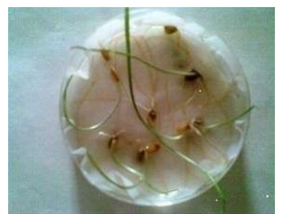
Fig.3Highly infected seeds after 3 days irradiation with Diode laser