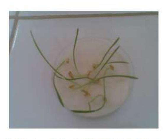
Fig.2 Seeds irradiated with SHG Nd-YAG after 3 days

Generally, SHG Nd-YAG laser significantly enhanced the germination percentage of wheat after 3 days to reach maximum of 93% after irradiation. For the percentage of non germinated seeds there were no important variations. On the other hand, there were high significant differences in resistant to fungi infection among the three types .Seeds irradiated with SHG Nd-YAG laser, no fungi infection was recorded Fig.2, while seeds irradiated by the two other types show highly infection especially after 3 days Fig.3, and the Petri plates which added to them antifungal agent show significant increase in infection with and without irradiation Fig4.