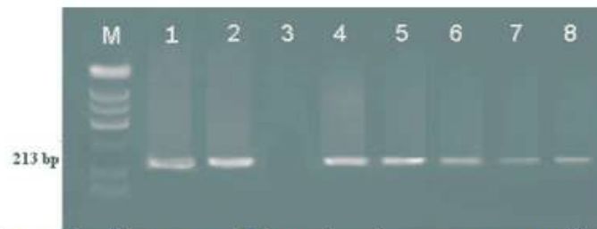
Fig. 2. Amplified product analyzed by 1.5% gel electrophoresis. Lane 1, 2, 8 positive amplification of brain, Lane 3 negative amplification from breast muscles, Lane 4, 5, 6 positive amplification from heart. Lane 7 Positive amplification from leg muscles, Lane M molecular weight marker 100 bp