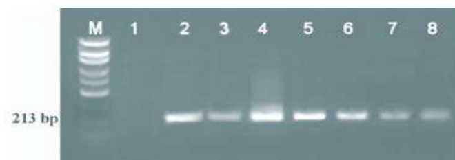
Fig. 1. Amplified product analyzed by 1.5% gel electrophoresis. Lane 1: negative blood sample for Toxoplasma, Lane : 2,3,5,6,7, 8 positive amplification. Lane 4 : positive control samples . Lane M molecular weight marker 100 bp