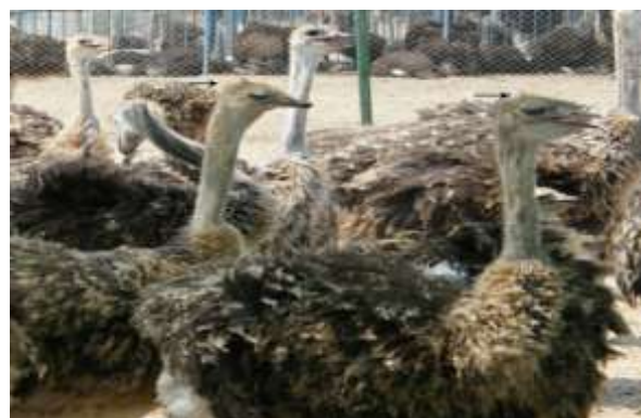
Fig. 3 Some ostriches showing eye affections (arrows)