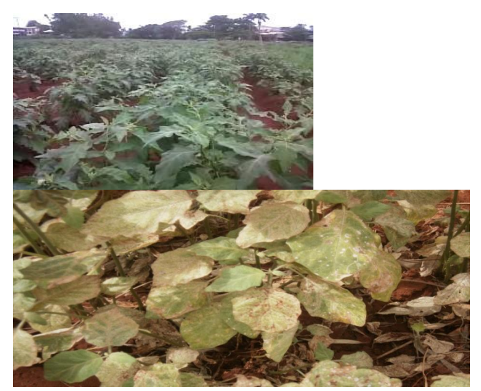
Solanum aethiopicum field Infested with leaf spot disease