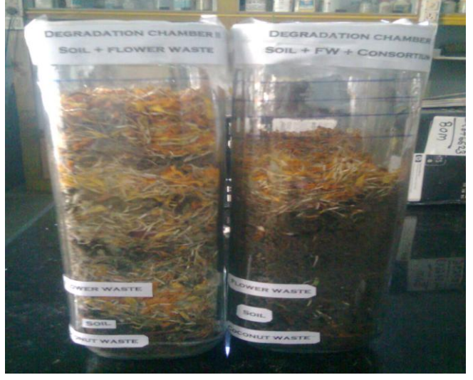
Figure 1 :Design of degradation chamber.