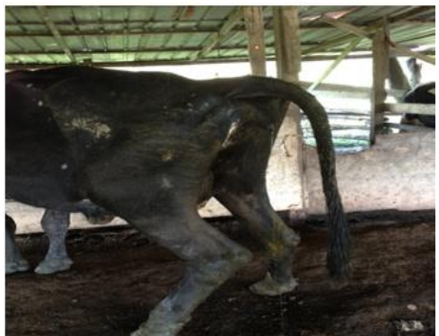
Figure 1: Kuning, one of the cattle affected with diarrhea and chronic weight loss.

Therefore the problems list, differential diagnosis and diagnostic workup at that moment were as illustrated in table 1 below: