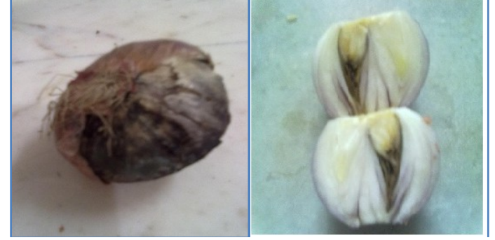
Figure-3Neck Rot Disease in Onion Figure-4Botrytis fungus in Onion

Figure-2 Biochemical content in fresh and infected Capsicum (Capsicum annuum)