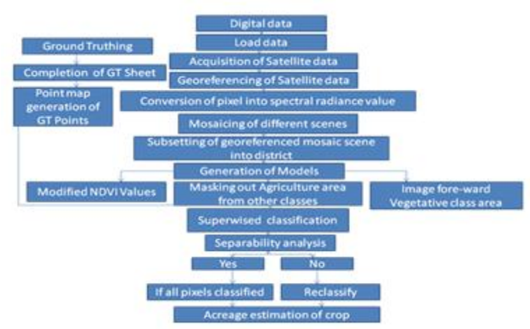
Figure1-Flow chart of Methodology for Acreage estimation

• Acreage estimation of crops for plain region