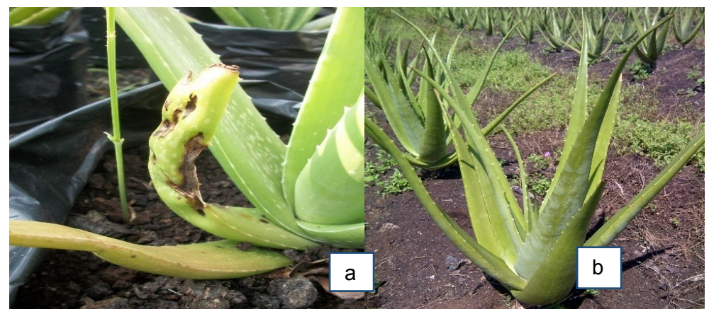
Figure 1. Aloe vera. (a)indication of the succulent leaf, which is contaminated by heavy metals,(b) normal succulent leaves

Relating to the above observation, it seems that the growth of hyper-accumulator and aloe vera will grow well even in Al-contaminated medium (Figure 1b). The aloe vera, which were planted solely, have been able to make an adaptation, up to the fourth month, by the Aluminum level for about 1747 mg kg<sup>-1</sup>, but some characteristics were seen, such as retarded growth and metal toxicity (Figure 1a). If it is ignored, along with the time passing by, the metal content in the soil will keep increasing and become toxicity to the aloe vera.