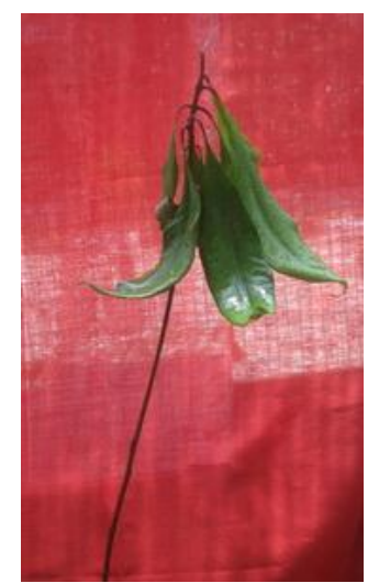
Figure 3. Symptoms of wilting in the pathogenicity test

Fig. 2. Symptoms of necrosis in tobacco leaf that showed a positive reaction in hypersensitive reaction test.