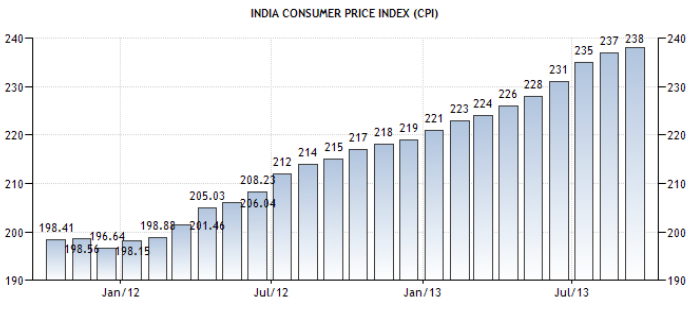
URCE: WWW.TRADINGECONOMICS.COM | LABOUR BUREAU, GOVERNMENT OF INDIA

Consumer Price Index (CPI) in India increased to 238 Index Points in September of 2013 from 237 Index Points in August of 2013. Consumer Price Index (CPI) in India is reported by the Labour Bureau, Government of India. Consumer Price Index (CPI) in India averaged 56.67 Index Points from 1960 until 2013, reaching an all time high of 238 Index Points in September of 2013 and a record low of 4.32 Index Points in March of 1960. In India, the Consumer Price Index or CPI measures changes in the prices paid by consumers for a basket of goods and services. This page contains - India Consumer Price Index (CPI) - actual values, historical data, forecast, chart, statistics, economic calendar and news. 2013