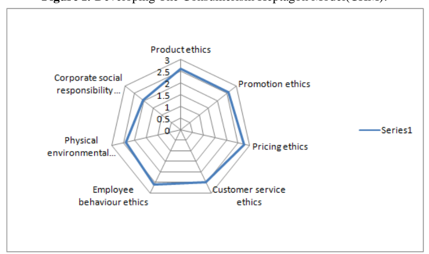
Figure I: Developing The Consumerism Heptagon Model(CHM).

Using the mean values generated for each consumerism variable a spider gram was plotted as on Fig I below.