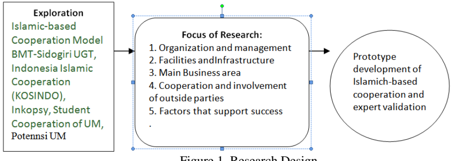
Figure 1. Research Design

Based on the existing phenomenon it will be identified the variables related to the development of the Islamic-based cooperation model. Results of these variables are then used as a basis for the development of designedIslamich-based cooperation model. Here is the figure of the research design.