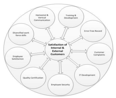
Figure 1: Model Elaboration: Quality Management for Branch Banking Operations

After reviewing previous or earlier literature review, there are some factors extracted by researcher. It has been noticed that roots of all possible factors, which are affecting quality management for branch banking operations, are leading to below mentioned factors extracted by researcher. Then researcher put them in simple model for easy understanding.