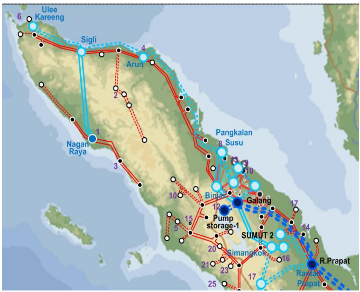
Figure 1 Transmission of Sumatera Utara

With the increase in peak load each year, especially on the island of Sumatra with a growth of around 7.43% per year (RUPTL 2019-2028), the PLN is required to be able to meet the power needs. The installed capacity in Sumatera Utara as of February 2019 is 3,400.2 MW with DMN 2,505.6 MW, based on the calculation of PLN it is estimated that it will experience a net power deficit in the electricity system in Sumatera Utara at the end of 2019 to reach 154.2 MW (by applying 30% reverse margin reserve criteria, and at the beginning of the year 2022 of 31.18 MW (without applying the 30% reverse margin reserve criteria) if the magnitude of peak load growth is not immediately anticipated by PLN, this could result in an electricity crisis in Sumatera Utara in early 2020 which will have an impact on rolling blackouts.