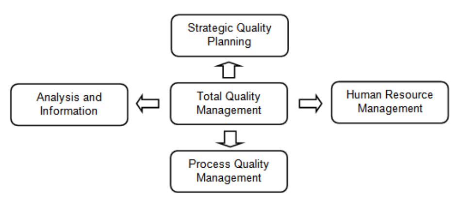
Figure 2: Baldrige Award Framework

(Neyestani and Juanzon, 2016).TQM metrics can evaluate the impact of the various types of FWAs that an organisation can start offering to its workers, specifically on organisational effectiveness and performance. The abovementioned frameworkincludes strategic quality planning, process-quality management, HRM and analysis and information (Figure 2).