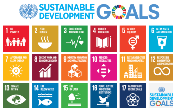
Figure 2 - Portuguese indicators for Sustainable Development objectives 16 .

Figure 2 presents the Portuguese Indicators for the Sustainable Development Goals, highlighting the interconnection of these objectives in favor of more equitable and sustainable development. This thesis project directly contributes to indicators 9, 12 and 14, reinforcing the commitment to sustainable practices, scientific research and economic development 16 .