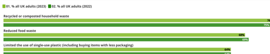
Exhibit 2: Deloitte Research On The Adoption Of Sustainable Behaviour

The same trend is also noticed globally and in a research conducted by Statista on shopping behaviors of consumers, approx. 70% consumers agree to changing their purchasing behaviours. Pls refer to exhibit 3 below.