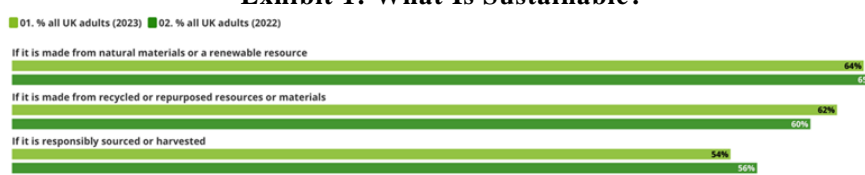
Exhibit 1: What Is Sustainable?

As per the exhibit above, not only that these factors are the highest in eyes of consumers but have remained top 3 for last 2 years.