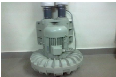
Figure 1: Blower

Large fans that move carriers through the tubes via vacuum and pressure. One or more three-phase blowers propel the carrier by means of compression or a vacuum created via a centrally controlled air switch. Self-adjusting Teflon gaskets in all system components guarantee airtight seals.