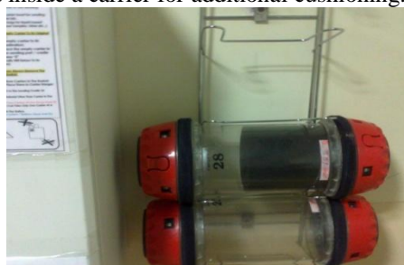
Figure 3: carrier

Carriers are reusable plastic containers that hold and protect items sent through a pneumatic tube system. Foam inserts can be placed inside a carrier for additional cushioning.