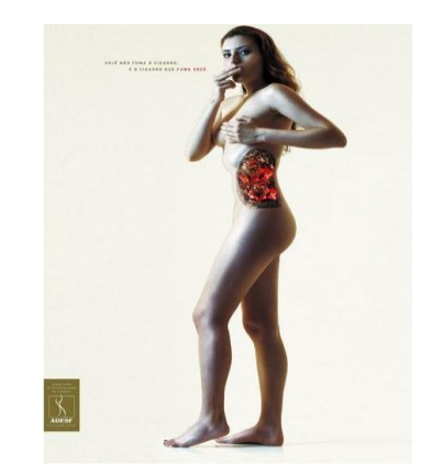
figure 1: You don't smoke cigarette, cigarette smokes you.

This poster gives a message to people, which is basically visual persuasion. Image tells, you don't smoke cigarette, cigarette smokes you. The girl illustrated shows a gesture of smoking, inside her body, her internal organs burn like the blaze of a cigarette.