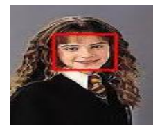
Figure 3.1 Selecting face from body

In this step the web cam connected to the system which is working actively and continuously will capture the motion at the door, The ROI (region of interest) will be processed to cut the face from the image and discard the remaining content of the image as shown in the figure.