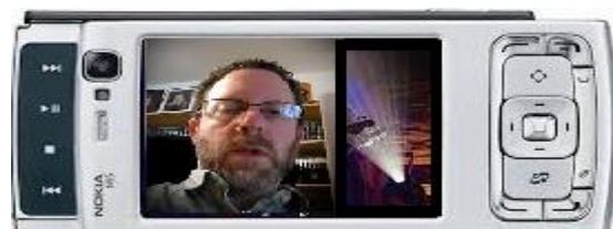
Figure 3.3 Image on user cell.

In this phase if the user confirms the face, action not necessary to be taken. But if the user declines to recognize the face, He can initiate the alarm process from his end as shown in the figure 3.3.