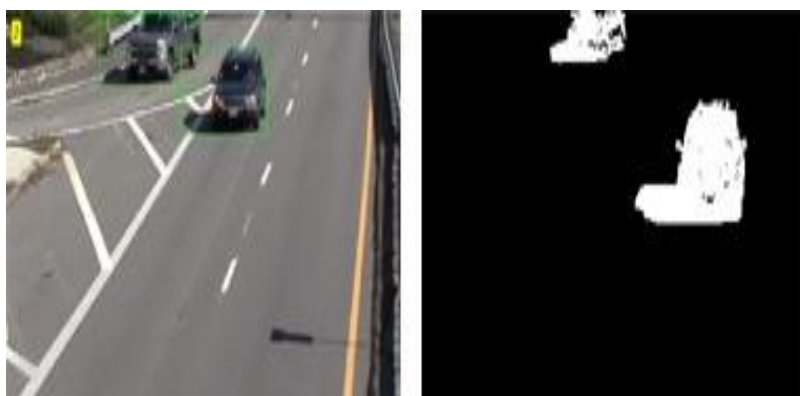
Fig 2.2 Object Detection

From Fig 2.2, moving objects are detected by classifying image pixels into foreground (white pixels) and background (black pixels) using Gaussian mixture models.