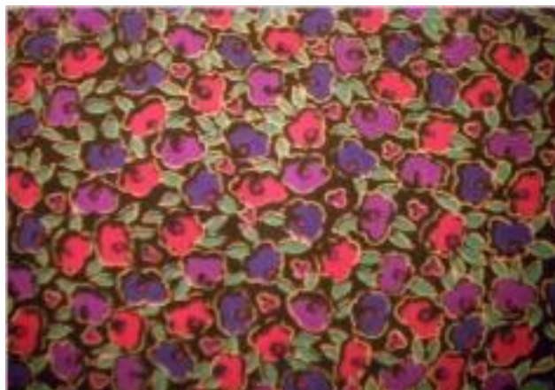
Fig 2.1 Pattern Recognition

Moreover, in solving the indefinite number of problems required to build such systems, gain deeper understanding and appreciation for pattern recognition systems. For some problems, such as speech and visual recognition, design efforts may in fact be influenced by knowledge of how these are solved in nature