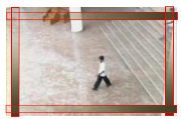
Fig. 3: General strip selection

If histogram of the strips in the current frame matches with the histogram of the strips in the previous frame and previous frame does not have any human then no tracking algorithms are applied in the current frame. If histogram of the strip in the current frame matches with the histogram of the strip in the previous frame and previous frame contains human object then correlation based method is applied for human detection.