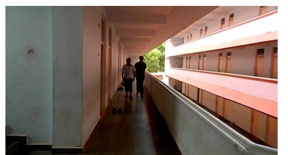
Fig.4: Frame in which strip selection not