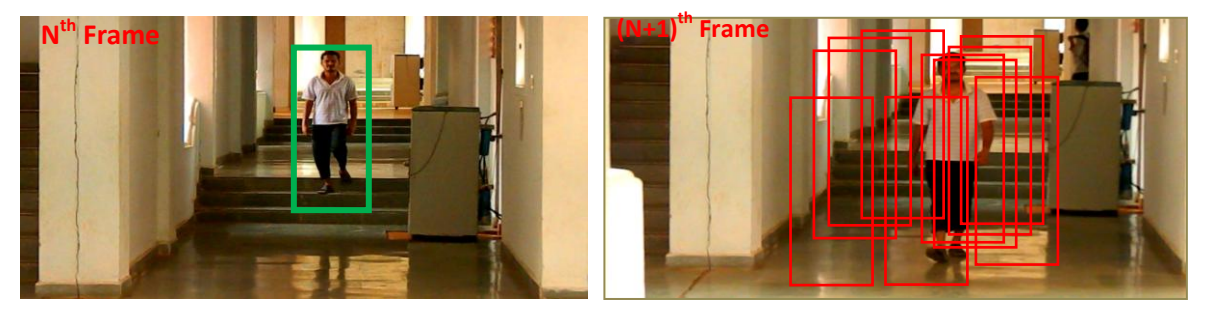
Fig. 6: Sample window selection