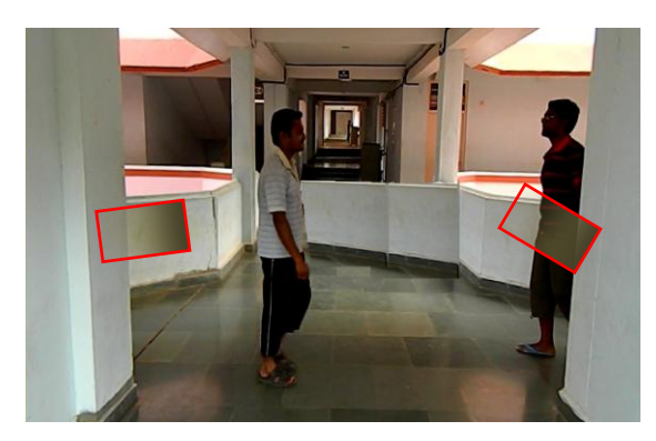
Fig. 2: Video frame with strips

Strips are selected at the entry and exit of the human object in video frame as shown in figure 2. In general case the strips are selected from the borders of the video frame as shown in figure 3. After the selection of strips from the video frames histogram of the strips are calculated. The position and number of strips in the frame is determined by the entry and exit of the object in the surveillance area. If histogram of strips in the current frame matches with histogram of the strips in the previous video frame, then no object has entered into the current video frame. If histogram of the strips in the current frame doesn't match with histogram of the strips in the previous video frame, it indicates that new object has entered into the surveillance area. In this case current frame is selected as the candidate frame for the HoG feature extraction and human detection and tracking is done using HoG features. In some cases, due to the structure of surveillance environment, strip selection will not give exact results, in such case candidate frames are selected in frequent intervals. Example for this type of video frame is shown in figure 4. HoG feature vectors extracted classified using adaboost classifier [16]. Figure 5 shows human detected using HoG features.