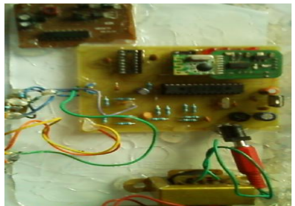
Fig. 5: Data Transmitter Module (Node 1)