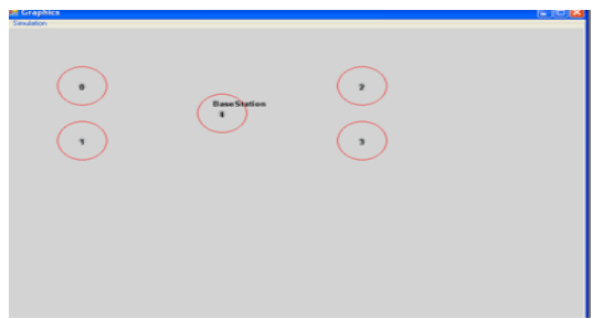
Fig. 8: Simulation of Nodes: Four nodes sending data to single receiver