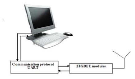
Fig. 2: System Side Block Diagram

The following diagram shows the hardware block diagram of proposed system.