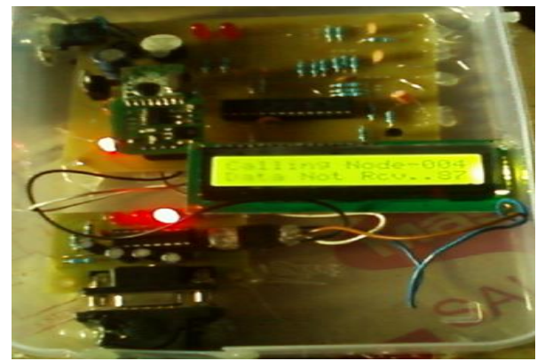
Fig. 4: Data Receiver Module