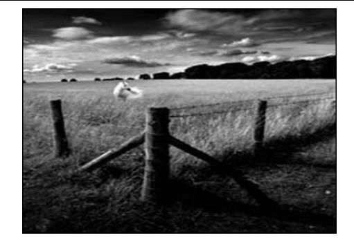
Figure (2) Original Image