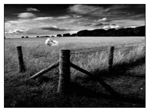
Figure (3)Image with embedded text

Table (1) tabulates the PSNR for the proposed system.