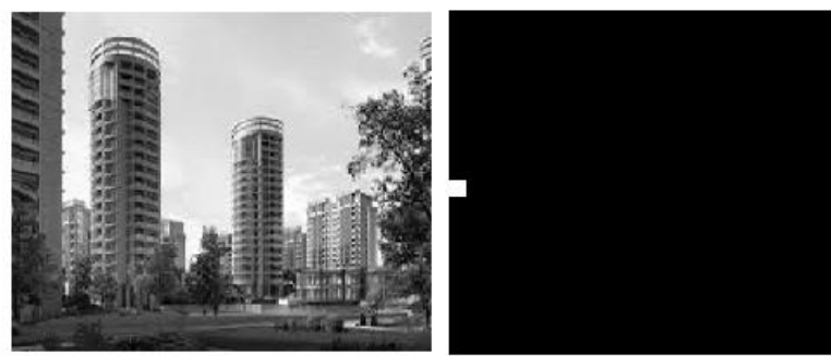
Fig. 3: (a) Original image, (b) CS-LBP extracted feature representation,(c) forged image,(d) shows the generation of mask of forged area in the image.