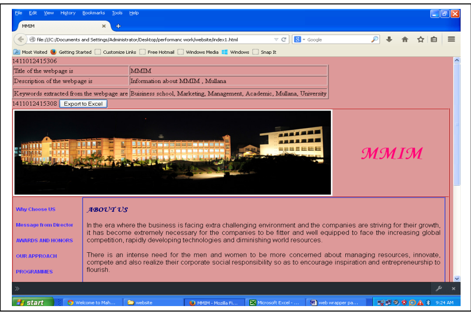
Fig 2: Webpage with extracted data

The relational web wrapper is developed on JavaScript platform. 3 Websites were developed in HTML and JavaScript for experimentation. The results from one of the websites are shown in fig 2, fig 3 and fig 4. Similar results are also available for other websites.