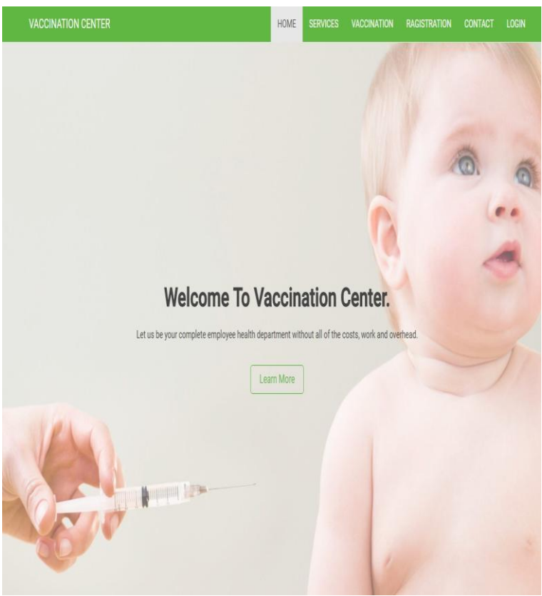
Fig 4. Home Page