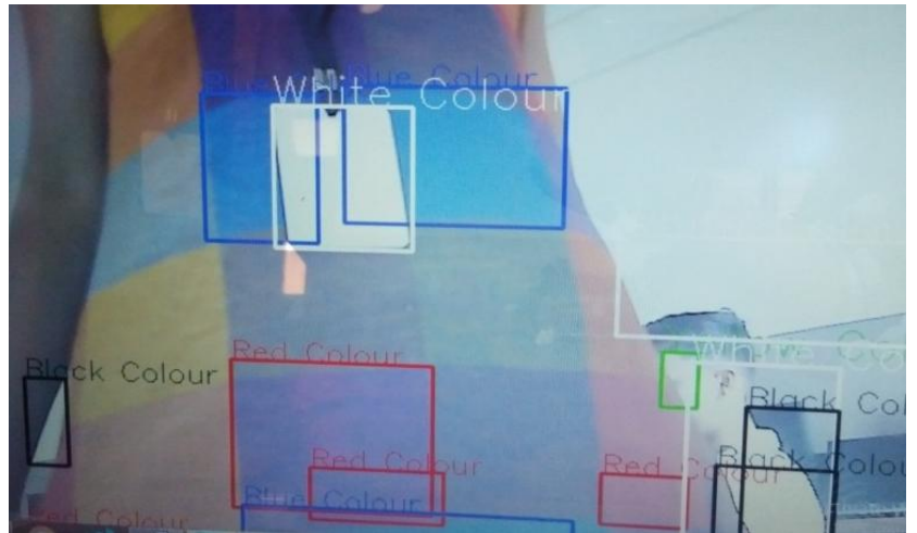
Fig.2. (b) Snapshot of Color Detection

The Raspberry pi is connected to the laptop with a USB cable. A free and open source application called Putty is used to run Raspberry pi on laptop. The pi is connected to USB camera. Open CV (Open Source Computer Vision Library) is installed on Raspberry pi for image processing. Whenever an object is placed in front of the camera, the camera detects color of the object as written in the code. Here, in the code, we have mentioned red, blue, yellow, white and black colors. Whenever these colors are detected by the camera it is shown on the screen. Morphological operator, dilation is used on the image generated by the camera. Hence, color detection is done with the help of image processing.