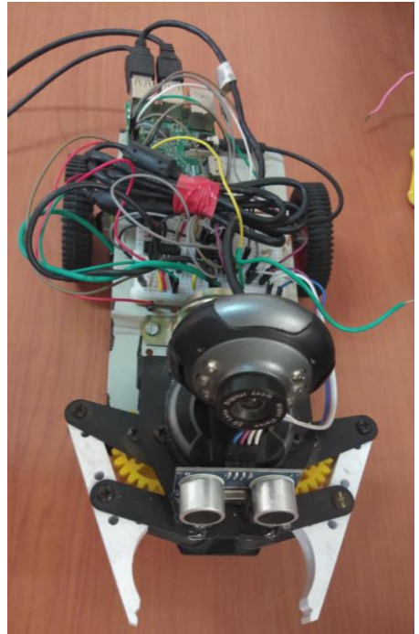
Fig.2. (c) Robotic Jaw

This is the model of the robotic jaw connected with raspberry pi and USB camera. The robotic jaw senses the object with the help of ultrasonic sensor. It detects the object as well as the color of the object and accordingly moves near to the object to do its sorting. The jaw, after detecting the color, picks up the object and takes it to the specified position. The distance for every color object is pre specified in the code.