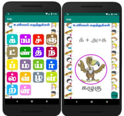
Fig. 7.4 Compounds (Uyirmeiyeluttu)module of application

Compounds-In Fig.7.4 if user can select consonants(meiyeluttu). This module main concept in this application. If the compounds word produced to vowels and consonants combination it's to produced. Each letter has been let us audio type.