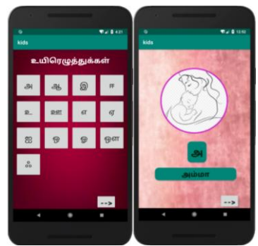
Fig. 7.2 Vowels(uyiryeluttu)module of application

Consonants-In Fig. 7.3 if user can choose this module 18 letters and words are displayed.