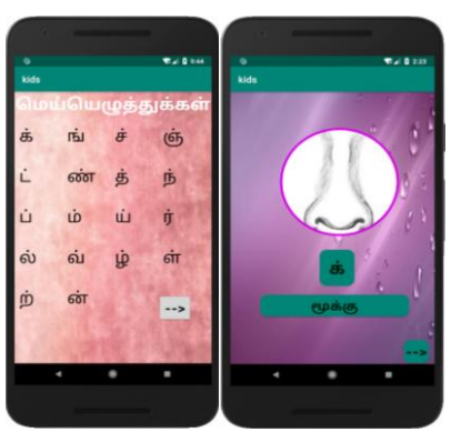
Fig. 7.3 Consonants(meiyeluttu)module of application

Consonants-In Fig. 7.3 if user can choose this module 18 letters and words are displayed.