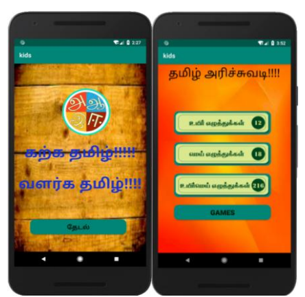
Fig. 7.1 Main Screen of Application

The user can select the any one option given below the Fig 7.1. The application has been displaying the detail. If user can select Vowels(uyirlettu) application has been displayed the details given below the Fig.7.2