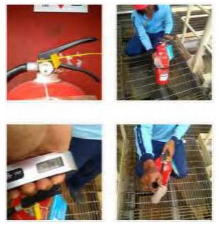
Figure 2. K3 officer inspect the fire extinguisherregularly using the IZAT Application data base

Implementation of this software start from May 2016. the K3 officer inspect the fire extinguisherregularly using the IZAT Application data base, as shown in Figure 2. Based on the application, the K3 officer can find out which fire extinguisher will expire and use it for fire fighting training. Therefore, the dry chemical of fire extinguisher can be reuse before it become B3 waste.