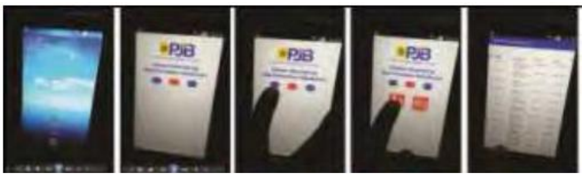
Figure 1. IZAT Application software

Implementation of this software start from May 2016. the K3 officer inspect the fire extinguisherregularly using the IZAT Application data base, as shown in Figure 2. Based on the application, the K3 officer can find out which fire extinguisher will expire and use it for fire fighting training. Therefore, the dry chemical of fire extinguisher can be reuse before it become B3 waste.