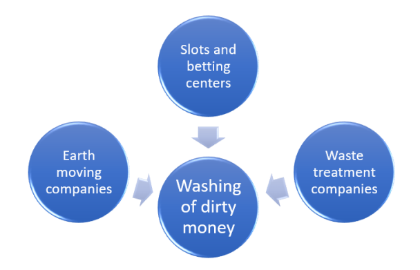
Figure 2 Money laundering

Below is an example of a general value: the diffusion of betting centers. It is a national data that has been gaining interesting weight and gravity since the 1980s (F. Calderini, S. Caneppele, 2009). The criminal geography of contracts. The infiltration of organized crime into public contracts in the South of Italy... There are mafia families specialized in the imposition of slot machines in the different territories. The volume of business is enormous and the system has become a means to launder large amounts of dirty money (fig.2).