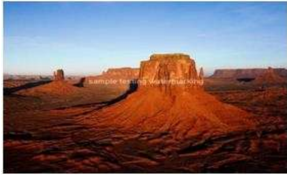
Fig.5 Stego image

Selecting the secrete file or data file for embedding into the watermarked image. The secrete file should be video, image, text file. Figure 4 shows the watermarked image. Fig.5 shows the stego image means secrete file is embedded into the watermarked image and there is no visible difference between the fig.4 and fig.5 images.