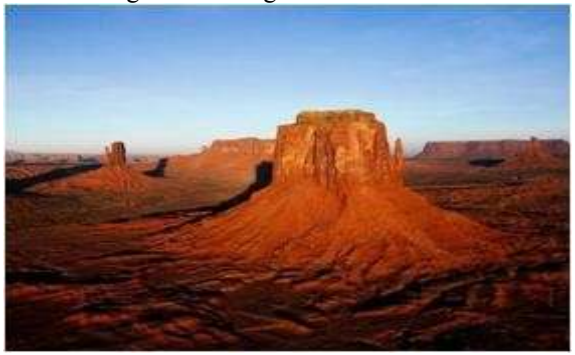
Fig.3 cover image

Select the original image or cover image for watermarking and embedding the secrete file. The Fig.3 shows Desert image as selected as a cover image. The Text entered for watermark is, "Sample testing watermarking", result of the watermarking shows in fig.4 and there is no distortion in the image.