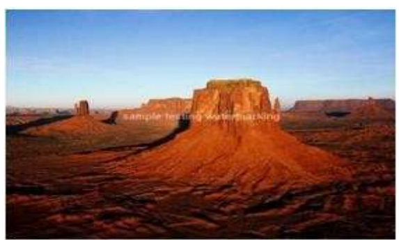
Fig.4 Watermarked image