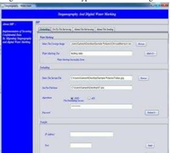
Fig.2 Design of the project

In this paper using both AES and 3DES. This paper is implemented in java. Here can use any one algorithm to encrypt and same algorithm to use for decrypt the data. Below fig.2 shows the design of the project.