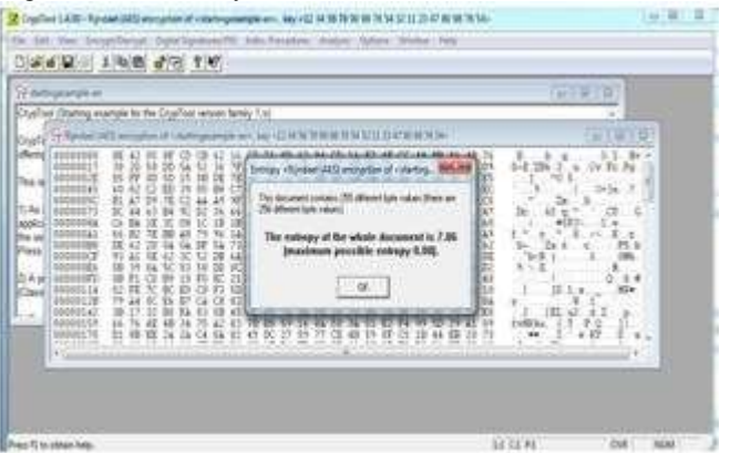
Fig.7 AES encryption efficiency

The above fig.6 shows the efficiency of 3DES algorithm. This algorithm is giving a more efficient than AES, out of 8.00% 3DES is getting 7.99% efficiency.