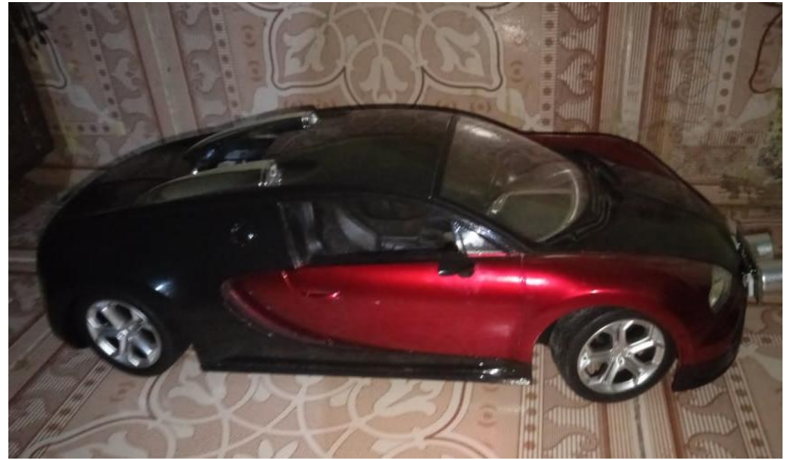
Fig. When Car is Moving