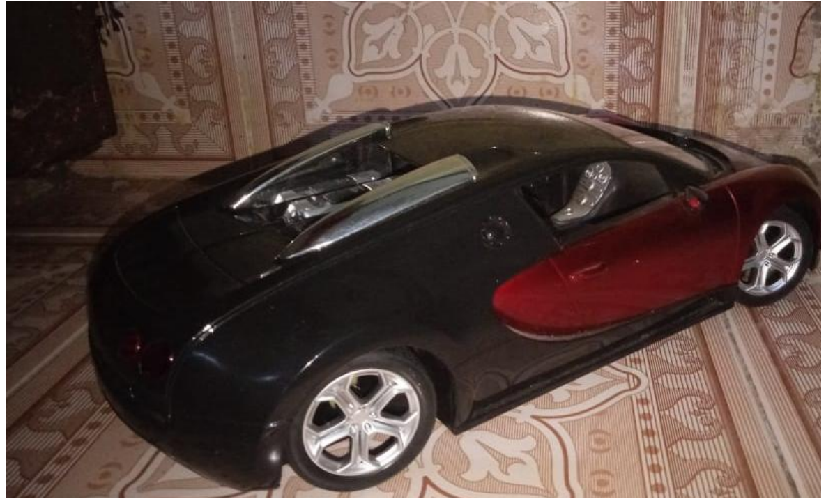
Fig. Car While Taking Turn