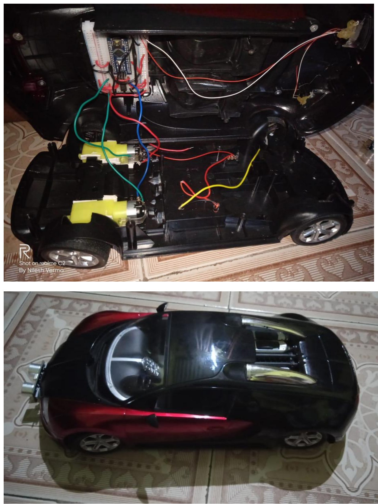
Fig. 3. Designed Robotic Vehicle

Fig 1 shows block diagram of prototype Mobile Robot (Vehicle). Our main focus was on Following Vehicle, which detects and avoids obstacles, get route and follow the route. Another application in which vehicle maintains specified distance from obstacles around. The vehicle automatically moves and hence relaxes the Driver. The Fig. 2 and 3 shows the hardware implementation. To look for the obstacle, ultrasonic sensors