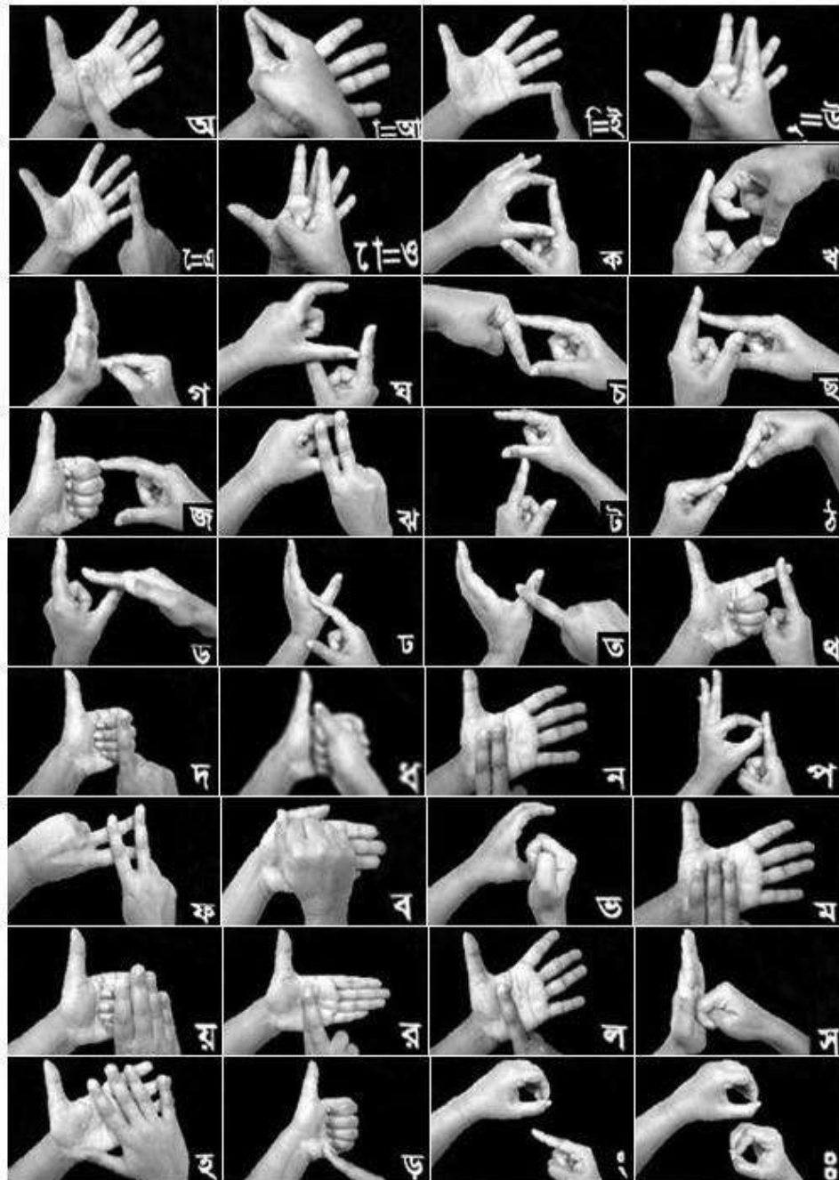
Figure 1: BSL Alphabet

The Sign Language Alphabet is a set of alphabetic finger signs. The Bangla Sign Language alphabet is shown in below: