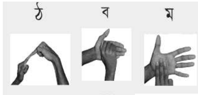
Figure 3: Some samples of recognized signs of BSL

In the present study, the highest recognition rate is obtained 'এ', 'ক', 'চ', 'ট' and 'ব' for and the lowest recognition rate is found for 'ই', 'দ', 'জ', 'ফ' and 'ং'. Figure 3 illustrates 3 (three) recognized 'ঊ', 'ব' and 'ঘ'.