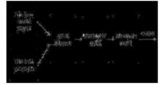
Figure 1: Proposed Neuro-Fuzzy model for cost estimation

Xishi [6] et al. proposed a Neuro-Fuzzy model for cost estimation which is modified in the current paper. It is applied on various estimation problems for accuracy. The Neuro-Fuzzy model contributes