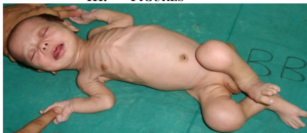
Fig:1: Stickler syndrome with neonatal-onset osteoarthropathy with large prominent knee joints