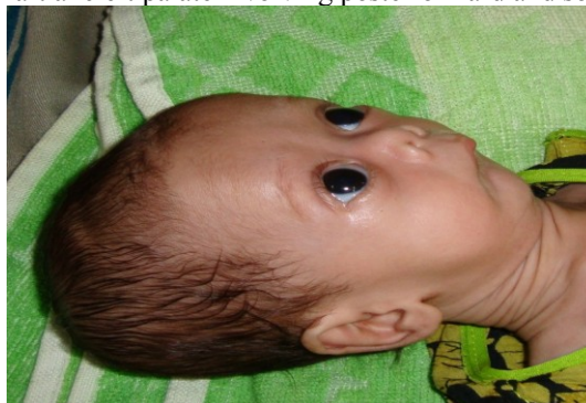
Fig:3: Large prominent eyes with depressed nasal bridge, malar hypoplasia, micro-retrognathia, anteverted nostrils