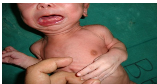
Fig:5: Hands showing moderate arachnodactyly