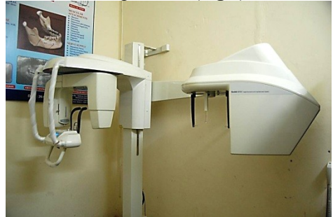
Fig 1(KODAK 8000C)

Then the lateral Cephalogram exposed with jaws in centric relation, lips relaxed, and the head in the Natural head position. The radiographs were obtained with Kodak X-ray machine with model no: 8000c (fig 1). All the Cephalogram were recorded with the same exposure parameters and in the same machine. These Cephalogram were traced, and ANB, Wits appraisal, and Beta angle and W-angle were measured to find the antero-posterior dysplasia and most reliable amongst them. (Fig 2).