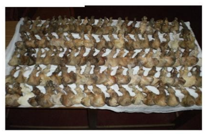
Figure 3: Showing measurement of width and death in female hip bone