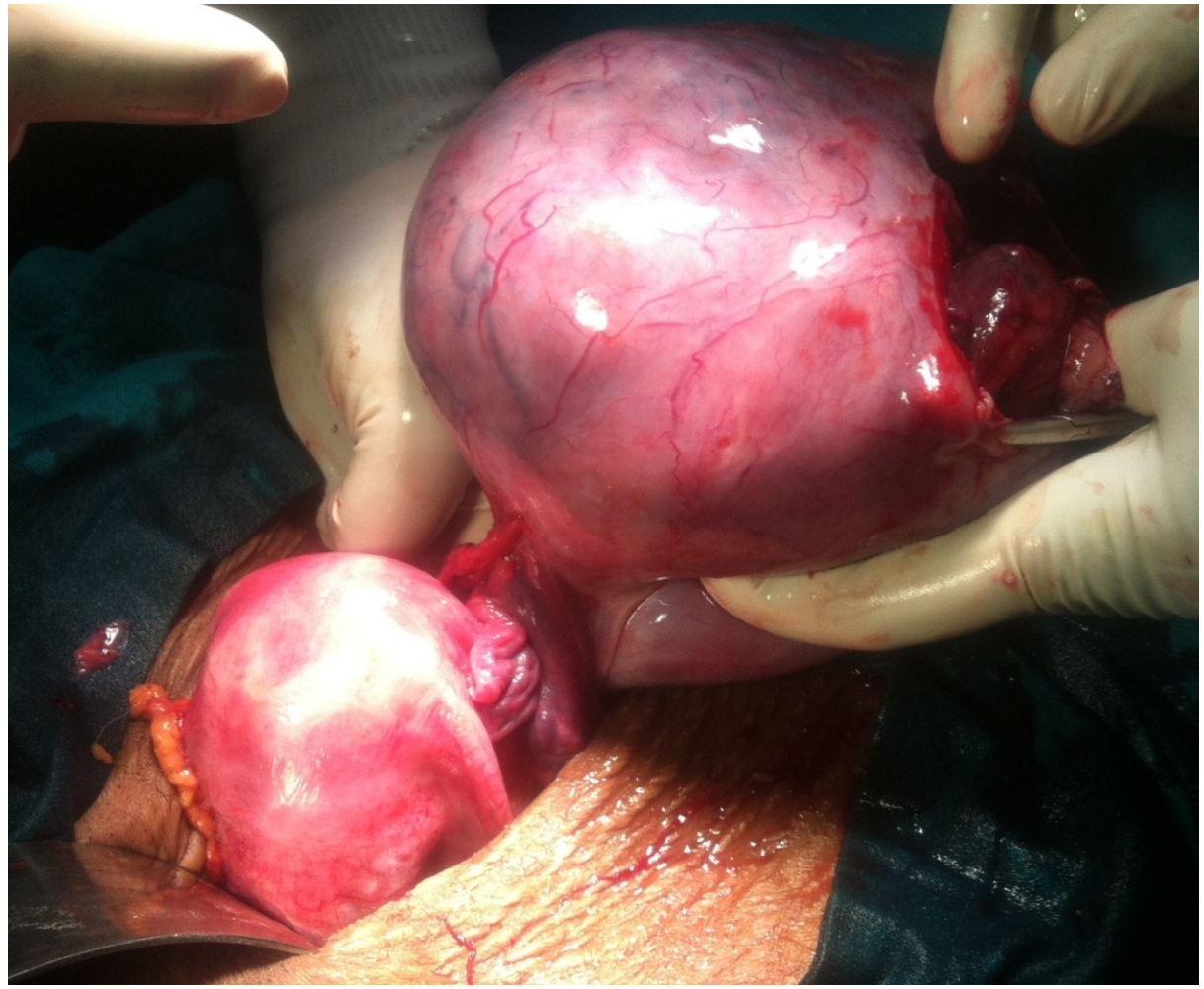
Fig 1: Intraoperative picture showing left ovarian dysgerminoma.

mass which were carefully separated. A thorough inspection of peritoneum, liver surface and omentum was done. There were no peritoneal deposits or palpable lymph nodes. The surface of the uterus, right tube and ovary appeared normal. Left tube and ovary were removed along with the mass. Ovarian cystic fluid was sent for cytological examination while the whole mass with left tube and ovary were sent for histopathological examination. Omental biopsy and paraarotic lymph node sampling was done which were negative for malignancy. Surgeons were called for assistance and expert opinion. After ensuring adequate hemostasis, abdomen was closed in layers. Her postoperative recovery was uneventful with suture removal done on postoperative day 8. Pt was discharged in good condition.